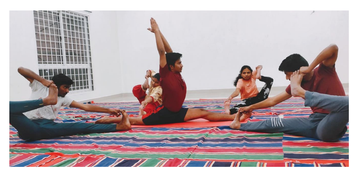
Student's practice 5