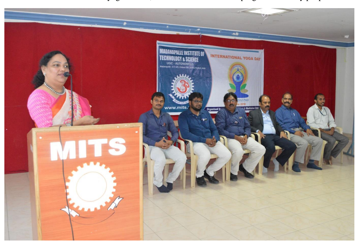
Yoga Day 2018