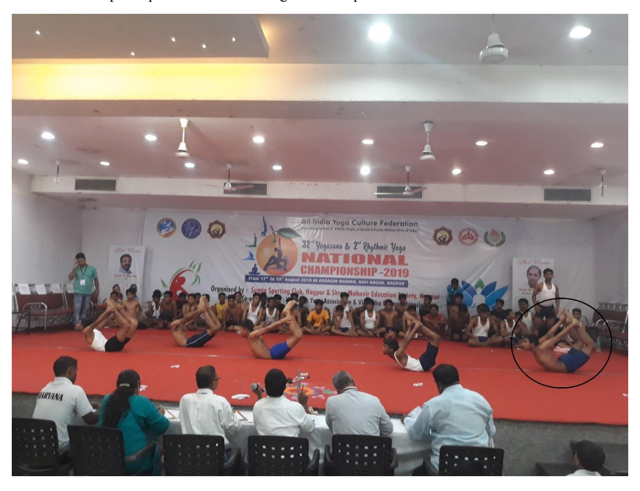
MITS student's participation in National Yogasana Competitions 2019-2