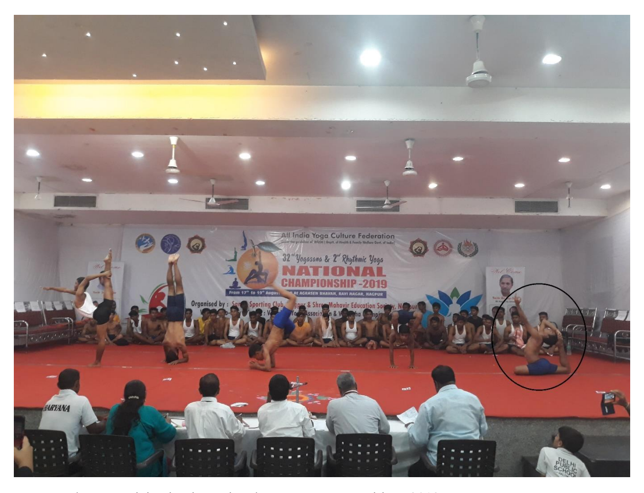
MITS student's participation in National Yogasana Competitions 2019-3