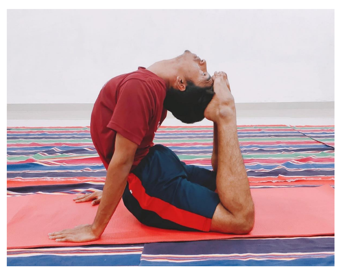
Student's practice 7