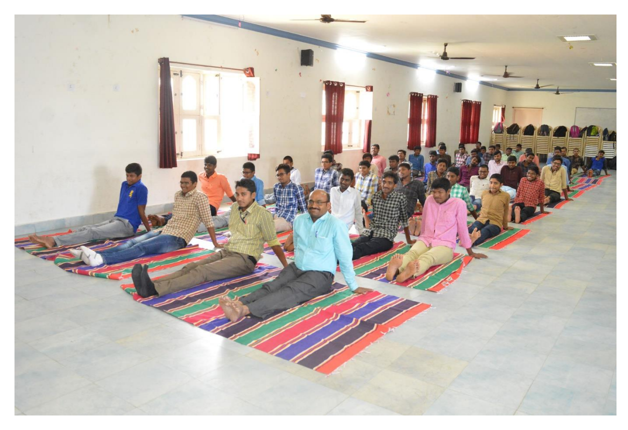
Yoga Day 2018