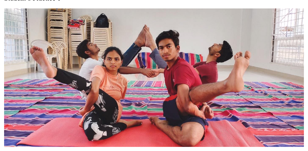
Students practice 2