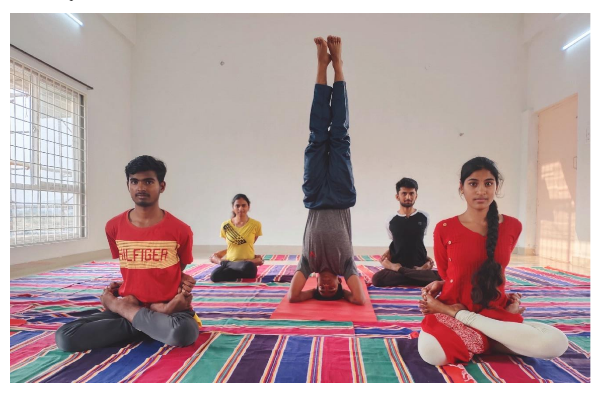
Student's practice 4